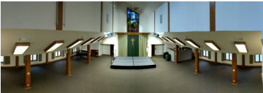
The Rivera Library, attached to

For those who bring their sleeping arrangements with them in the form of motor homes or campers, our RV sites come with complete hook-ups.