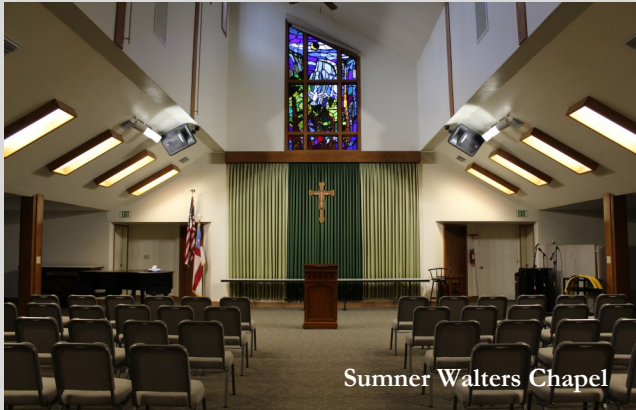
Sumner Walters Chapel

Located 12 miles from the south entrance to Yosemite National Park and an hour north of Fresno, the Episcopal Conference Center, Oakhurst sits at an elevation of 3,100 feet. We're high enough to escape the central valley fog yet low enough to enjoy a dusting of snow in the winter, along with a colorful four-season climate. ECCO's grounds encompass 163 forested acres with oak, incense cedar, manzanita and ponderosa pine.